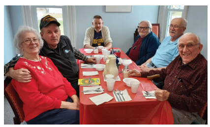
Senior Neighbors Centers are just as important to the community in 2022 as they were in 1972.