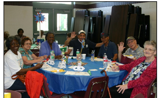
Community Partners in Philanthropy are recognized at the annual Senior Picnic, pictured above, attended by more than 300 seniors each year