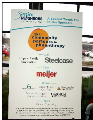
Special recognition at events

Through an annual sponsorship, Community Partners in Philanthropy receive sponsorship benefits for a full year of events including Meet Your Neighbors, the inaugural 16 Over 60 Awards Gala, and exclusive recognition at client-focused events. Client-focused recognition occurs throughout the year at the Senior Picnic and Senior Odyssey of Michigan, as well as prominent signage at our five Senior Centers and Main Office.