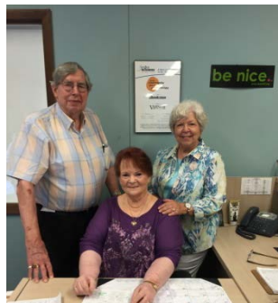
Grandville Center members gather around a special plaque recognizing Community Partners in Philanthropy