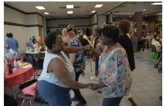
Community Partners in Philanthropy are recognized at our annual Senior Picnic, pictured above, attended by more than 300 seniors each year