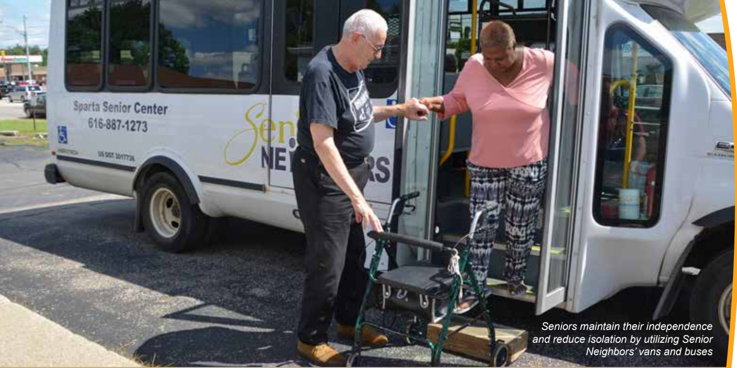
Seniors maintain their independence and reduce isolation by utilizing Senior Neighbors' vans and buses