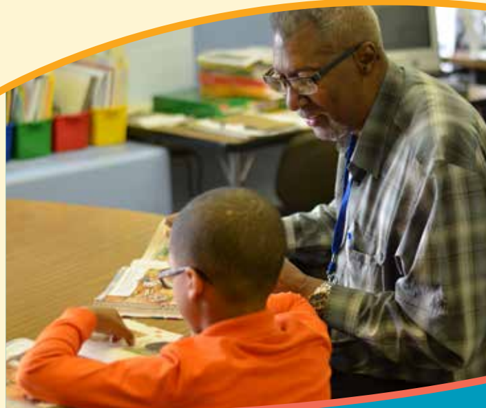
Experience Corps volunteers tutor elementary school students to improve their reading levels and literacy.

The new programs include AARP Experience Corps, Foster Grandparents, Traveling Grannies & Grandpas and Senior Companions. We are extremely grateful to Steelcase Foundation and Grand Rapids Community Foundation for making this merger possible.