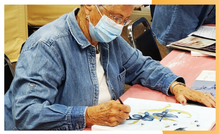
Fiscal Year 2021: October 1, 2020-September 30, 2021